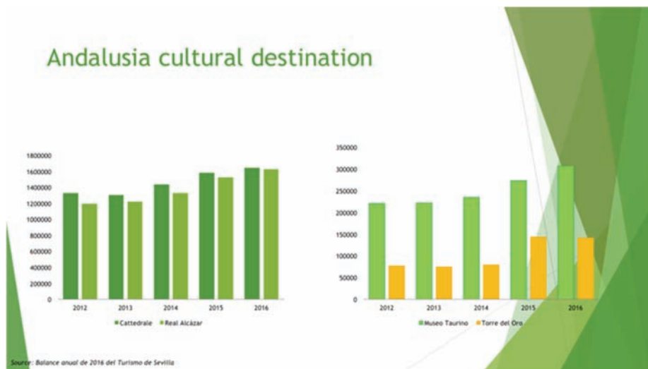
Figure 1. Main point of interests of Sevilla

Starting from an analysis of the Spanish territory, the attention is then focused on the city of Seville. Considering the data related to Spain, it is evident an ever-increasing positioning in the last decade. In 2011, the Iberian nation was considered the eighth country in the world for tourism competitiveness. Just two years later, it had already managed to climb four in the position. Indeed, since 2015 Spain has been the first country in terms of tourism competitiveness in the world (Porter, 1991).