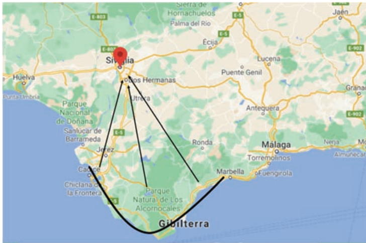
Figure 2. Tourist flows from costs to Seville

transformation was observed in the urban landscape, as well as improvements in infrastructure and public services.